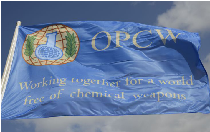
A flag with the logo and mission of the OPCW

The Advisory Body on Administrative and Financial Matters (ABAF) is a subsidiary body of the Executive Council established to provide advice on administrative and financial matters. Its role is to examine the draft annual programme and budget, internal oversight reports, audits and other budgetary proposals submitted by the Secretariat and to report its findings to the Council. The ABAF's members are experts of recognised standing in financial and administrative fields appointed by the members of the Executive Council.