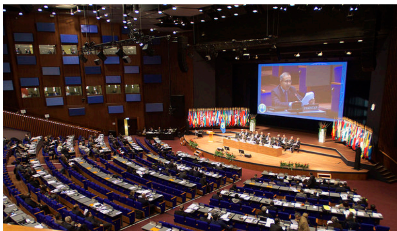
A session of the OPCW Conference of the States Parties

The Conference is composed of representatives of all Member States of the OPCW, each of which has one vote. It meets annually for one week in The Hague. Special sessions of the Conference can be convened under the following circumstances: when decided by the Conference itself, when requested by the Executive